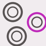
White blood cells (including T cells)