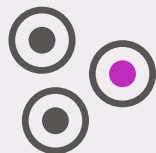
Red blood cells